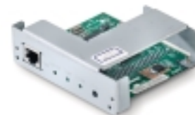
10/100BASETX ETHERNET CARD