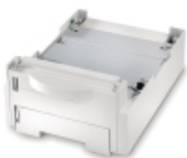
SECONDARY TRAY - CAPACITY OF 500 SHEETS