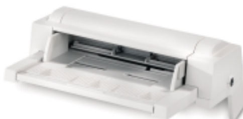
MULTI-FEEDER - 100 SHEETS / 50 ENVELOPES